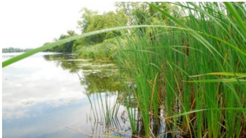
A Lake Ontario coastal wetland.

Lakewide management is guided by a shared vision of a healthy, prosperous and sustainable Lake Ontario in which the waters are used and enjoyed by present and future generations. Although much effort has gone into the protection and restoration of the lake, some stressors continue to limit the health, productivity, and use of Lake Ontario and its connecting river systems.