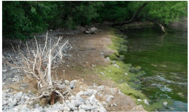
Cladophora on the Lake Ontario Shoreline at Four Mile Creek State Park.

Great Lakes agencies are focusing efforts to better understand the distribution and extent of Cladophora growth in the Great Lakes and the relationship between accumulation of algae and associated washups along the shoreline.