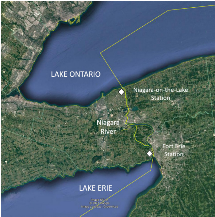
ECCC upstream (Fort Erie) and downstream (Niagara-on-the-Lake) sampling locations on the Niagara River.

Additionally, total phosphorus inputs from Lake Erie via the Niagara River account for the majority of phosphorus load to Lake Ontario and, in some years, exceeds the Lake Ontario target of 7,000 metric tonnes per annum (MTPA) (7,716 tons per annum; TPA). Using the most recent data (2014–2018), ECCC calculated the mean Niagara River total phosphorus load to be 5,275 MTPA (5,815 TPA).