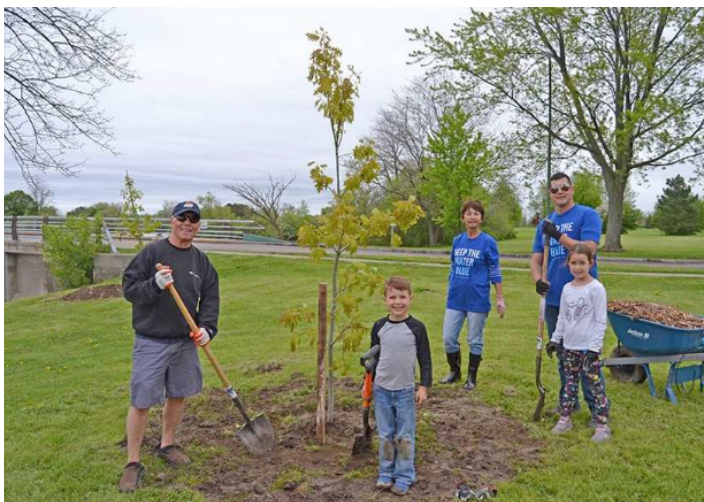
Volunteers at work at Ellicott Creek Park.

The non-profit agency Buffalo Niagara Waterkeeper (BNW), in partnership with Erie County Parks, used a U.S. Department of Agriculture Forest Service Great Lakes Restoration Initiative grant to plant 792 trees, comprising 27 species, throughout Ellicott Creek Park.