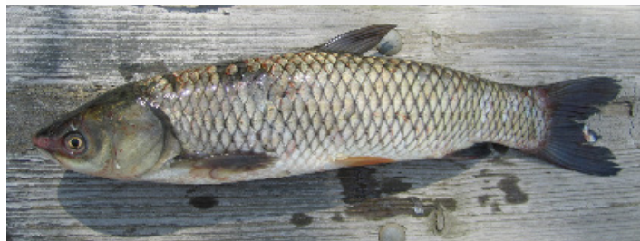
Top to bottom: The Bighead, Black, and Grass Carps.

Asian Carp are voracious eaters and grow very large very quickly. They can quickly outgrow predators and can out compete native species for