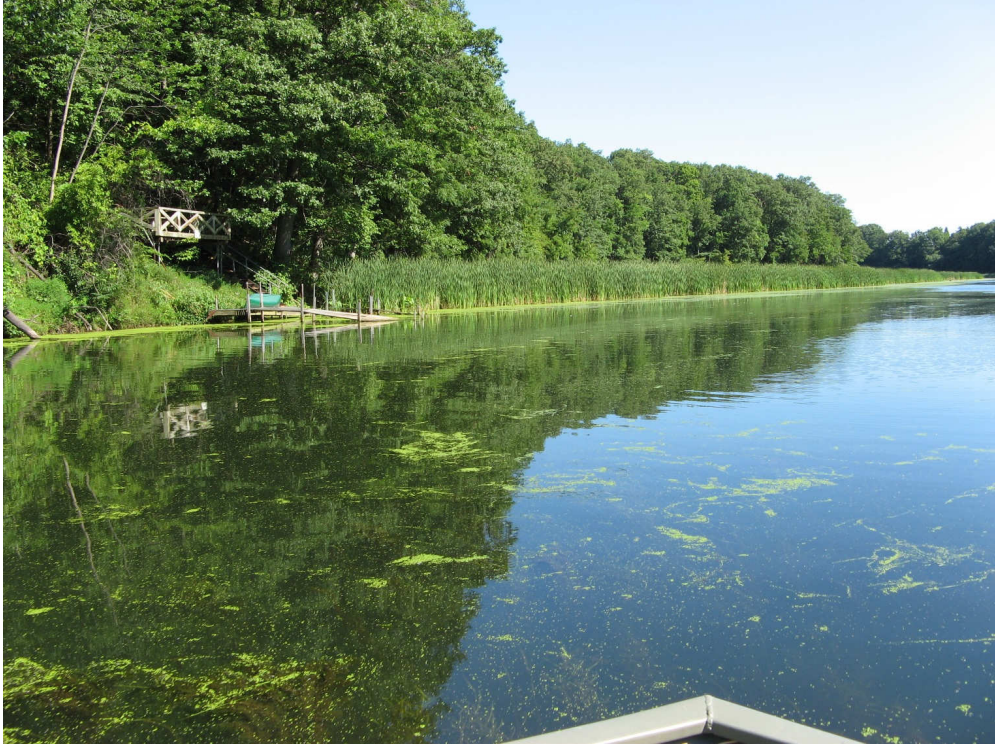
Figure 4 - Midstream sampling location