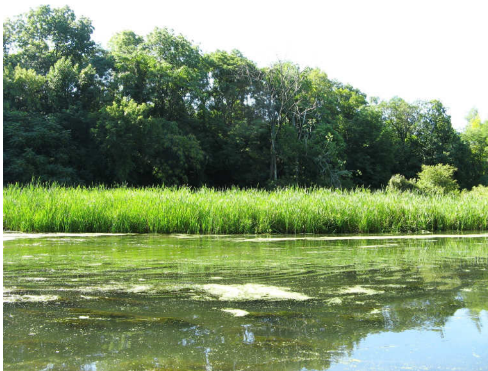
Figure 3 - Upstream sediment sampling location.

Samples were collected for analysis of PCBs, Metals, Pesticides, and Total Organic Carbon (TOC). Samples were analyzed at the EPA Laboratory in Edison, New Jersey. The analytical methods utilized are summarized in Table 2.