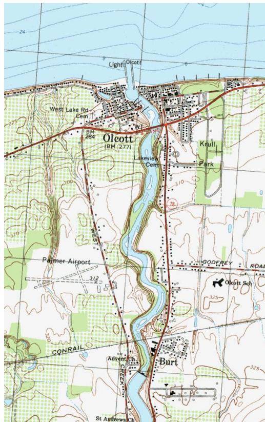
Figure 1 - Eighteen Mile Creek

In the mid-1980's Eighteen Mile Creek (Niagara County) was designated as a Great Lakes Area of Concern (AOC). The underlying reasons for this designation were water and sediment quality problems associated with past discharges and waste disposal practices. Numerous contaminants have been previously identified in creek sediments which have a detrimental effect on the AOC and on Lake Ontario. These contaminants include polychlorinated biphenyls (PCBs), mercury, dioxins/furans, pesticides, lead, and copper. Sediment contamination has been a contributing factor in the issuance of health advisories regarding the consumption of fish and wildlife taken from Eighteen Mile Creek. The New York State Department of Health advisory for all fish taken from Eighteen Mile Creek is to "eat none" (NYDOH 2008). The New York State Department of Environmental Conservation (NYDEC) has cited sediment contamination as a probable cause for listing Eighteen Mile Creek as an impaired water on its 303(d) list. Contaminated sediments have also resulted in restrictions on the disposal of dredged materials from the AOC.