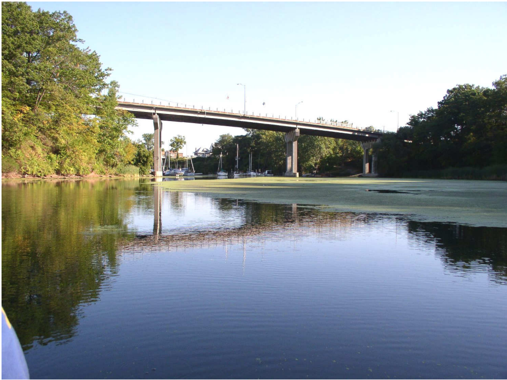
Figure 5 - Downstream sampling location